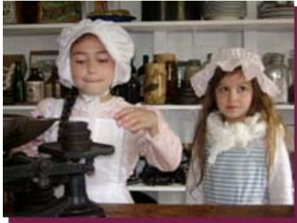
Learning outside of the classroom